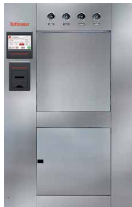
Manual Hinged Door