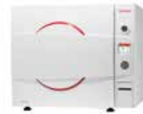
Benchtop autoclaves for life science applications