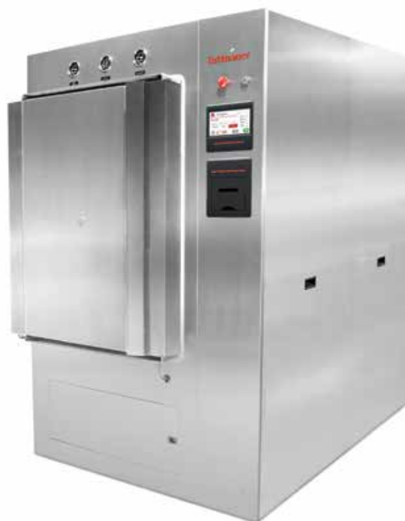
Automatic Hinged Door