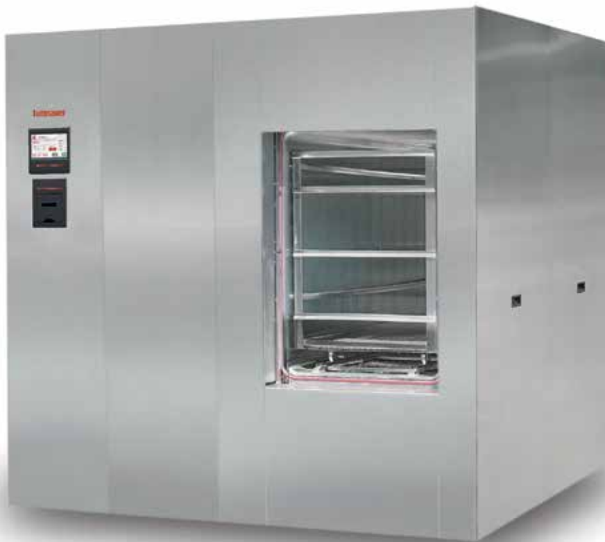
Horizontal Sliding Door