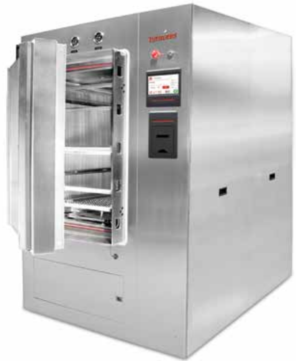
Automatic Hinged Door