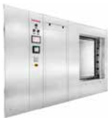
Pharmaceutical autoclaves designed in accordance with cGMP guidelines

Featuring Tuttnauer's range of cleaning, disinfection and sterilization solutions