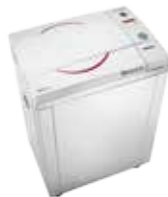
Vertical autoclaves for liquid, glassware, and biohazardous waste