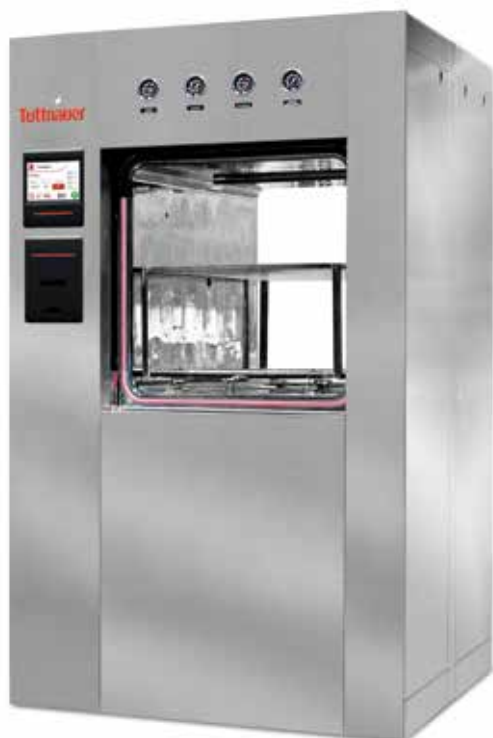
Vertical Sliding Door