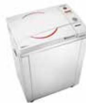
Laboratory autoclaves ranging in size and application