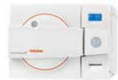
Pre & post vacuum tabletop sterilizers designed to perform class B cycles