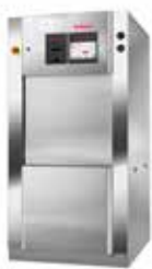
T-Max Line of Large Sterilizers

Featuring Tuttnauer's range of cleaning, disinfection and sterilization solutions