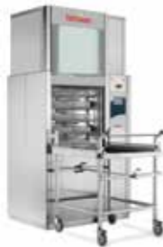
Washer disinfectors for hospitals and laboratories